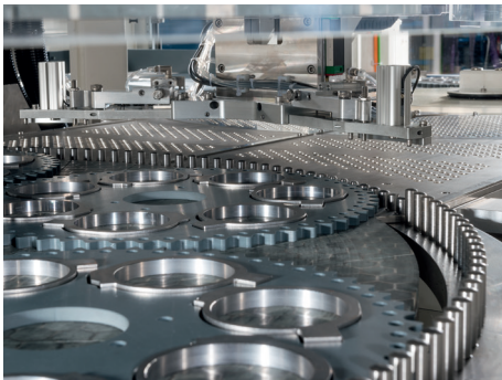
View from the process area into the Twin Loader – for shortest carrier exchange time