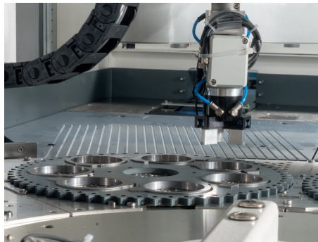
Robot Cell for automatic loading and unloading