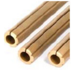
Single-Pass Sintered Diamond Sleeves