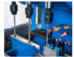
3 Spindles w/ Lateral Table