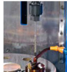
6 Spindles w/ Rotary Table