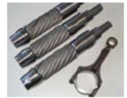
Con-Rod & Tools