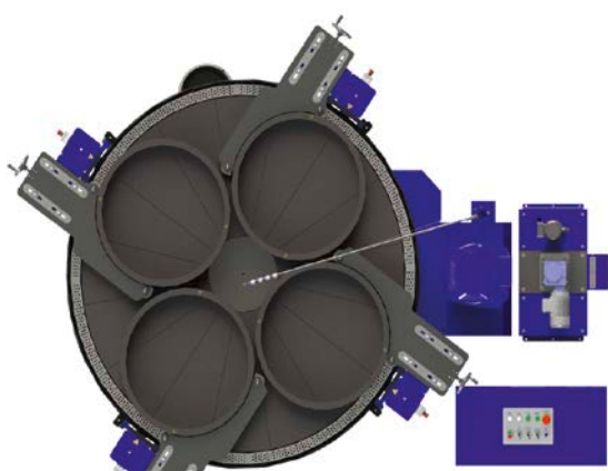
Open face version