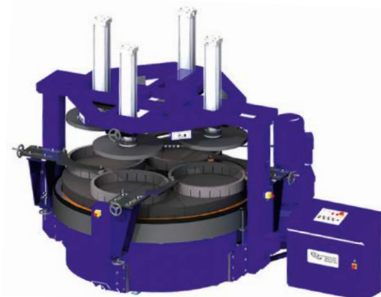
Open face version (left), pneumatic lift version