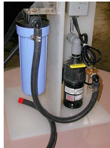
Integrated Cartridge Filtration System