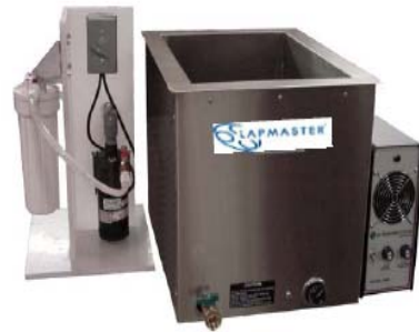
Bench-Top Ultrasonic with Filtration System /Outer Amp