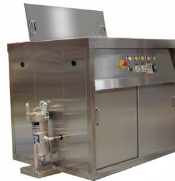
Floor Standing System with Cover and Filtration