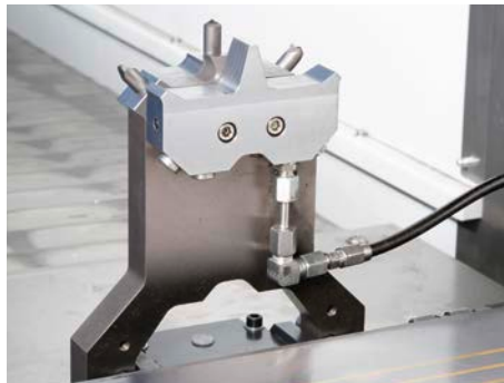
Tilt dressing unit with 3 diamonds