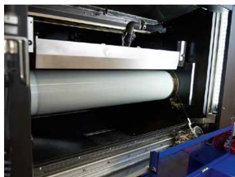
Long load length for more output