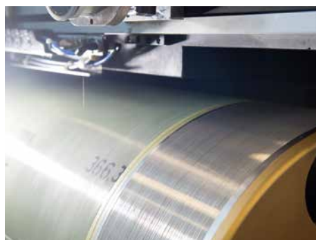
Thin wire for lower cost