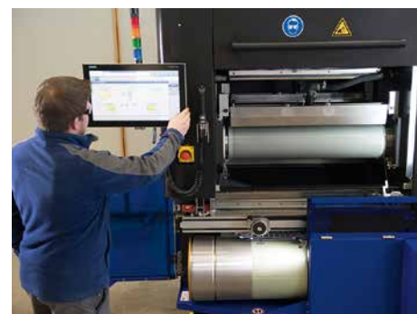
Easy operation for higher yield